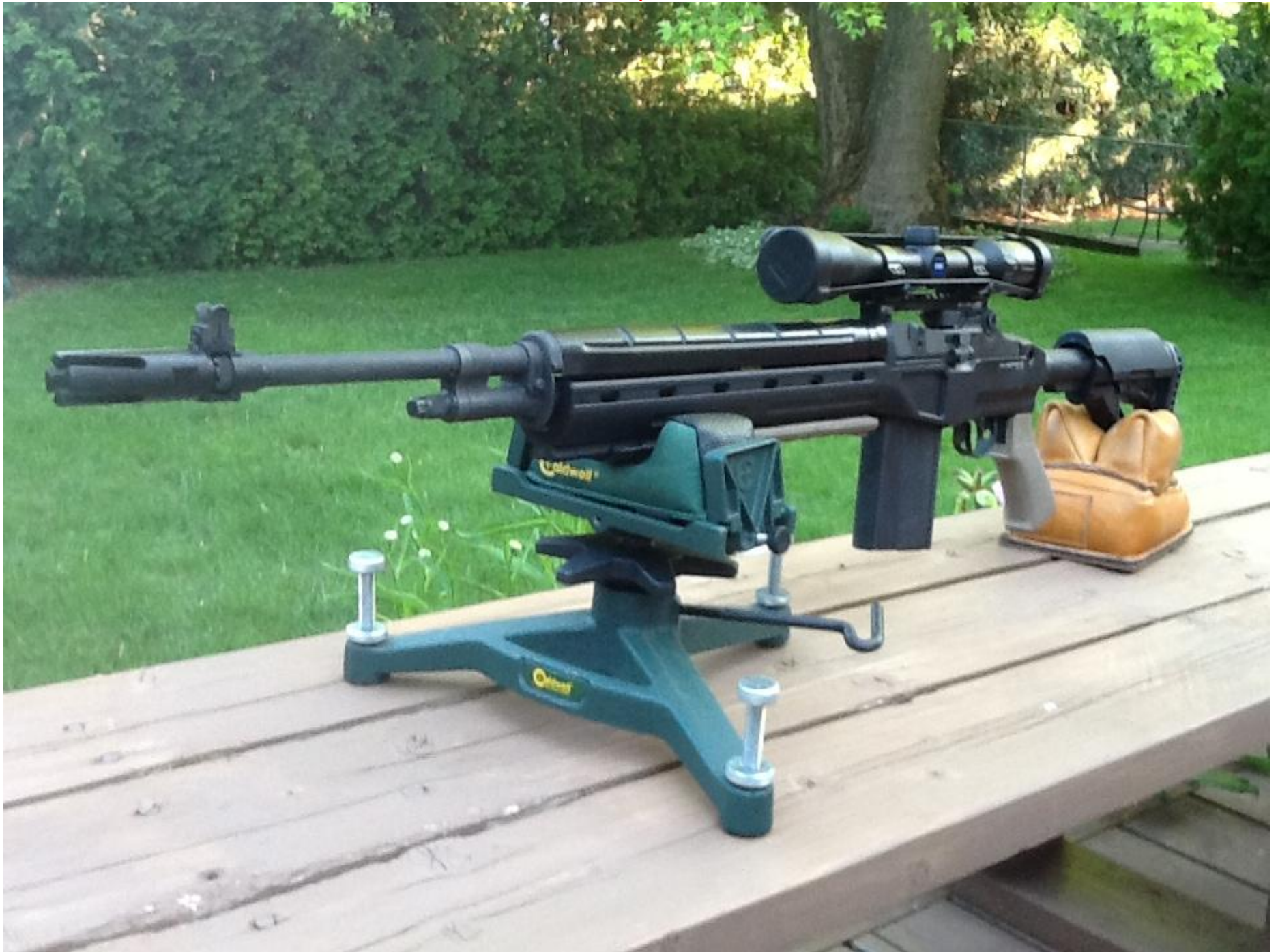
The Blackfeather RS with CASM GEN II scope mount and a standard Norinco M305 rifle.